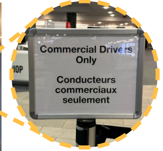
Designated Area for Chauffeur

Please contact our office immediately at 604-377-1618 (24 hours) should any problems arise.